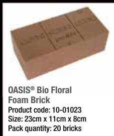
OASIS® Bio Floral Foam Brick Product code: 10-01023 Size: 23cm x 11cm x 8cm Pack quantity: 20 bricks

Step 3: A couple of nestled Roses will add focal areas. Spray completed design with Floralife® Finishing Touch.