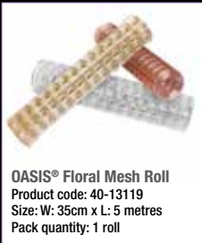
OASIS® Floral Mesh Roll Product code: 40-13119 Size: W: 35cm x L: 5 metres Pack quantity: 1 roll

All products available at www.oasisfloral.com.au