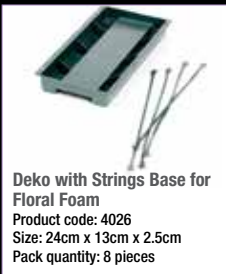
Deko with Strings Base for Floral Foam Product code: 4026 Size: 24cm x 13cm x 2.5cm Pack quantity: 8 pieces