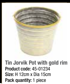
Tin Jorvik Pot with gold rim Product code: 45-01234 Size: H 12cm x Dia 15cm Pack quantity: 1 piece

All products available at www.oasisfloral.com.au