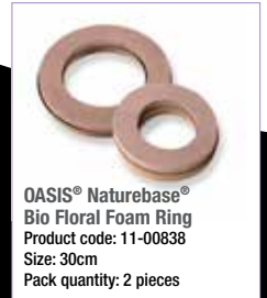
OASIS® Naturebase® Bio Floral Foam Ring Product code: 11-00838 Size: 30cm Pack quantity: 2 pieces

All products available at www.oasisfloral.com.au