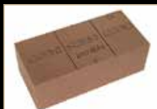
OASIS® Bio Floral Foam Brick Product code: 10-01023 Size: 23cm x 11cm x 8cm Pack quantity: 20 bricks