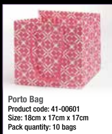
Porto Bag Product code: 41-00601 Size: 18cm x 17cm x 17cm Pack quantity: 10 bags