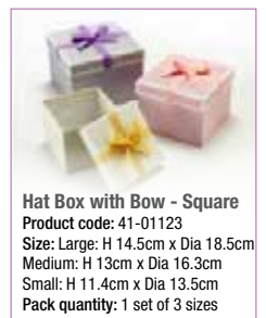
Hat Box with Bow - Square Product code: 41-01123 Size: Large: H 14.5cm x Dia 18.5cm Medium: H 13cm x Dia 16.3cm Small: H 11.4cm x Dia 13.5cm Pack quantity: 1 set of 3 sizes

Step 4. Add a stem of preserved Ming Fern at the back of the arrangement for colour and textural contrast. Create floral and spiral patterns with the Aluminium Wire before inserting into the top hat box so it cascades down to link the designs together. Spray completed design with Floralife® Finishing Touch.